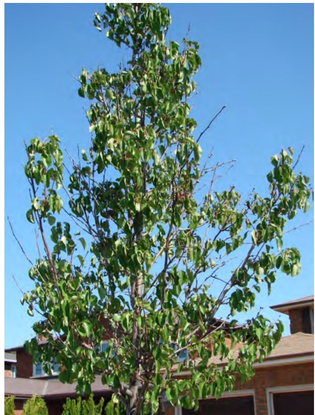
Ornamental Pear without biochar

Our biochar/Garlic Mustard forest trials will continue into 2017. The less diverse fungal populations in the GM patch supports established widespread understanding that garlic mustard suppresses beneficial fungi. In comparison, the control plot without GM had a higher variety of microbes. It will be of interest to see if fungal diversity reestablishes in the GM patch and if biochar continues to suppress the reemergence of this weed into 2017.