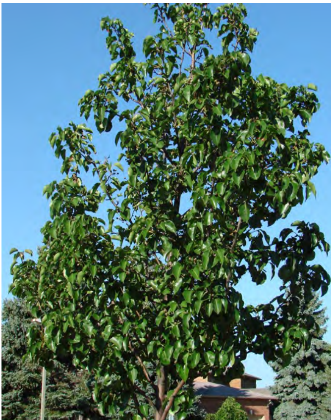
Ornamental Pear with biochar

With increasing higher temperatures and summer droughts, using biochar as a soil amendment will not only be of benefit to urban trees (as 2016 photos below taken in Vaughan will attest) but also useful in tree farms and organic urban agriculture.