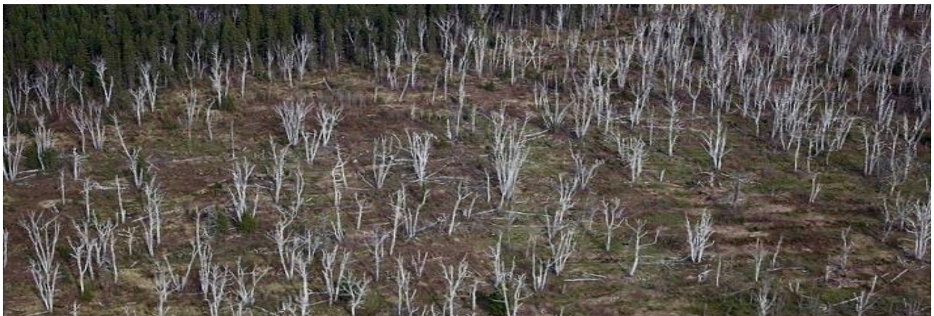
Hardwoods destroyed by aerial spraying of glyphosate, Boreal forest, Canada

YORK REGION ENVIRONMENTAL ALLIANCE 85 Dariole Drive Richmond Hill, ON L4E 0Z4 T: 905-660-9782 E: info@yrea.org