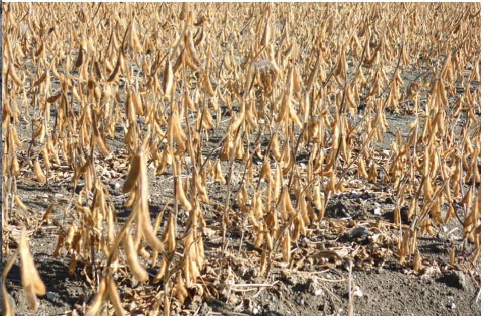
pesticides sprayed on crops as desiccant just before harvest