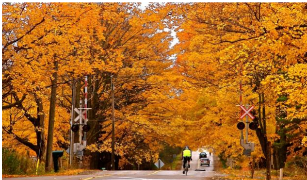
Gormley tree tunnel Leslie St. ORM/Greenbelt

It is with great relief that YREA acknowledged the news that the Ontario government has denied the Richmond Hill request to open up Oak Ridges Moraine and Greenbelt lands for industrial and settlement use. Gormley is a Heritage Conservation District that needs to be protected. By not paving over this strategic Moraine/Rouge Headwaters any further, there will be less risk of future flooding & an important drinking water source will be protected.